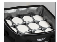
Shown with 12 compartment divider