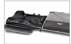
Collapses for storage