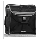
Large window for branding, menus