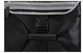
Heavy-duty locking clip