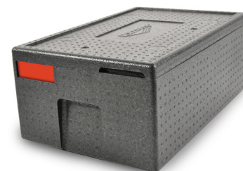
Shown with optional color tag